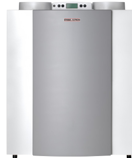
LWZ 370 PLUS

Price subject to change based on installation requirements. Please contact us for further information and a tailored quotation.