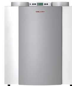
LWZ 170 E PLUS

Price subject to change based on installation requirements. Please contact us for further information and a tailored quotation.